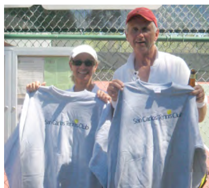
Loyal subjects get their just rewards