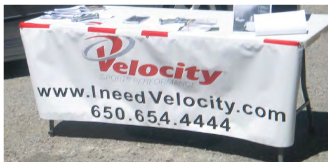
Our valued sponsor Velocity