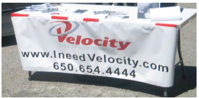
Our valued sponsor Velocity